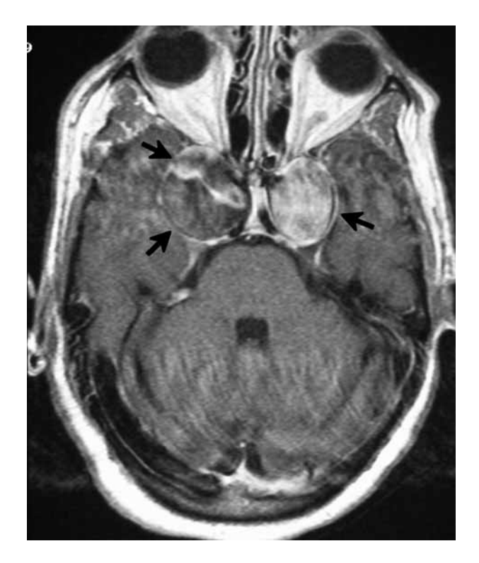
FIG. 2. — Axial T1 MRI after gadolinium displaying the aneurismal pouch within the two cavernous sinuses (arrows) partially thrombosed on the right side.

About one third of patients presenting with subarachnoid hemorrhage have multiple intracranial aneurysms (11). The bilateral symmetrical disposition of multiple intracranial aneurysms led to the denomination of "mirror aneurysms". These latter may arise from a bilateral embryological developmental anomaly of the vessels wall (11). Mirror aneurysms represent about 11% of many ICAA clinical series (3, 9). Several papers dealt with the identification of risk factors for multiple intracranial aneurysms (11, 12). Among these factors, we can quote regular cigarette smoking, female sex, arterial hypertension, and postmenopausal state (11). Otherwise, several hereditary connective tissue disorders have been identified as major risk