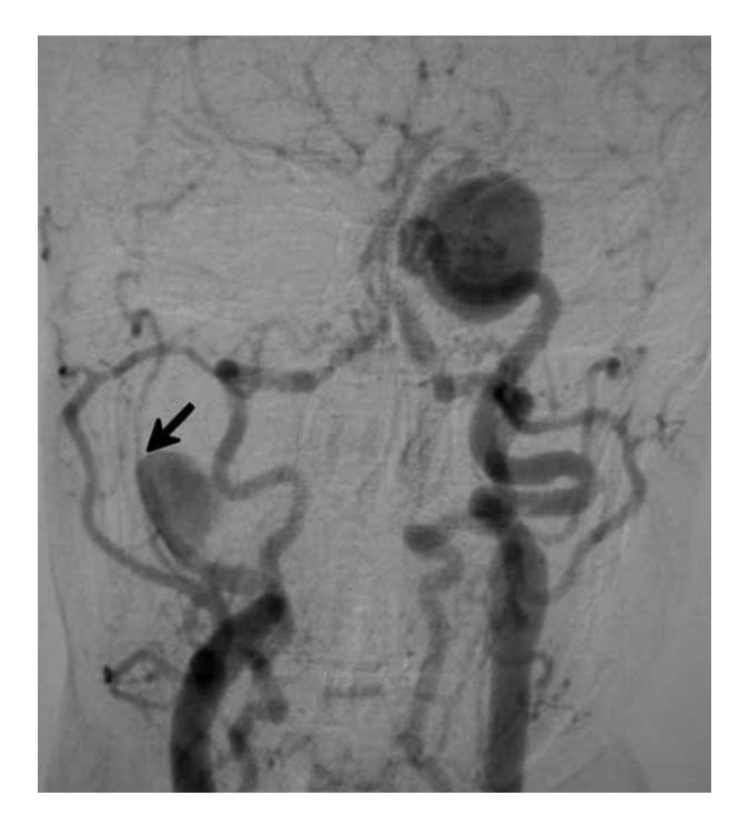
FIG. 4. — A frontal digital substraction angiography 4 days after the onset, showing thrombosis of the right internal carotid including the right ICAA (black arrow), while the left ICAA and the right cervical carotid aneurysm are well injected.

patients of Stiebel-Kalish et al. who presented with diplopia, 56% of them spontaneously improved (3). The same rate of improvement was reported concerning the pain in the untreated group.