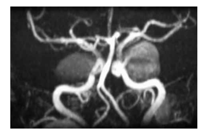
FIG. 1. — Frontal MR Angiogram showing two mirror aneurysms of the cavernous portion of both internal carotid arteries.